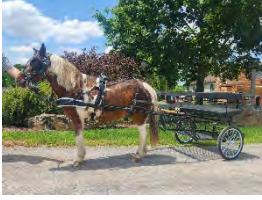
7 yr Gelding pony rides/drives with new cart and harness