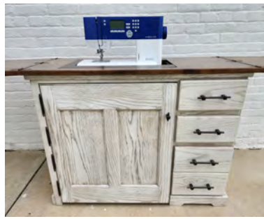
Sewing Machine Cabinets