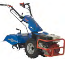
BCS 7E 20" Tiller