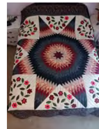
Floral Lone Star Quilt