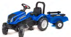
NH T6 Pedal Tractor, Trailer