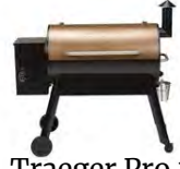
Traeger Pro 34 Wood Pellet Grill

6:30 AM Breakfast | 8:30 AM Auction Begins | 10:00 AM Theme Baskets | 11:00 AM Remarks by CSC Doctors & Staff 12:00 PM Quilts | 12:00 PM Carriages, Lawn Furniture, Household Furniture | 1:00 PM Toys