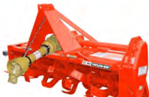
Taylor 923 Tiller 48 In