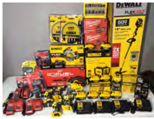
New Cordless Tools