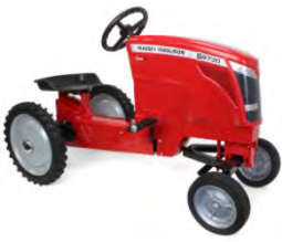
Massey 8730S Pedal Tractor Wide Front