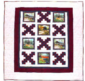
Covered Bridge Irish Chain

135 Brethren Church Road, Leola, PA 17540