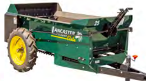
Lancaster Manure Spreader G25 Ground Driven