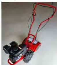
Earthquake Victory 16" Tiller