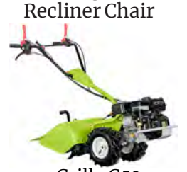
Grillo G52 with 19" Tiller