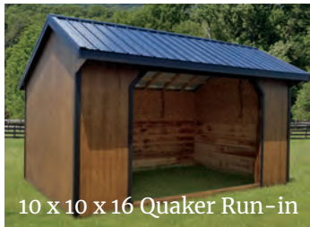
10 x 10 x 16 Quaker Run-in