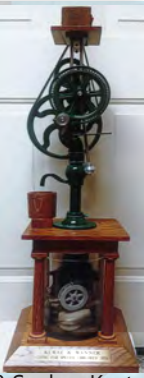
1/3 Scale - Kurtz & Wanner Pump