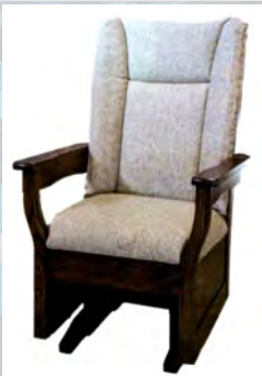
Horning Glider Rocker