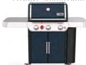
Webster Genesis Gas Grill SA E330