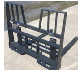
Pallet Fork 4000 lbs