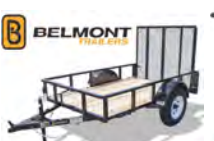
Belmont 5x8 Utility Trailer