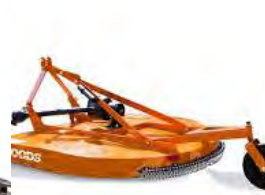
Woods RC 48.20 Rotary Mower 48 In