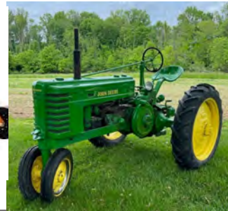
JD 'H', Lights, PTO, starter