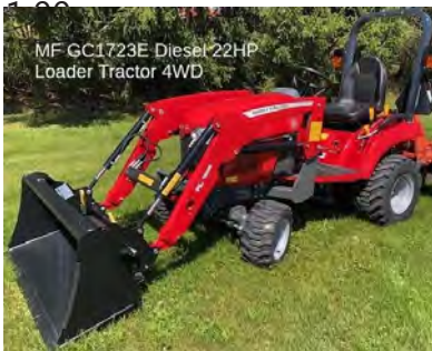
MF GC1723E Loader Tractor 4WD

6:30 AM Breakfast | 8:30 AM Auction Begins | 10:00 Theme Baskets | 11:00 AM Remarks by CSC Doctors & Staff | 12:00 Quilts | 12:00 Carriages | Lawn Furniture | Household Furniture | 1:00 Toys | Silent Auction Ends