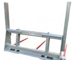
EZ Bale Handler

ABOUT THE CLINIC FOR SPECIAL CHILDREN: The Clinic for Special Children was established in 1989 as a non-profit medical service for children with complex medical needs. The Clinic's mission is to serve children and adults who suffer from genetic and other complex medical disorders by providing comprehensive medical, laboratory, and consultative services, and by increasing and disseminating knowledge of science and medicine. Today, CSC cares for over 1,100 active patients from 42 states and 17 countries and treats over 400 unique disorders.