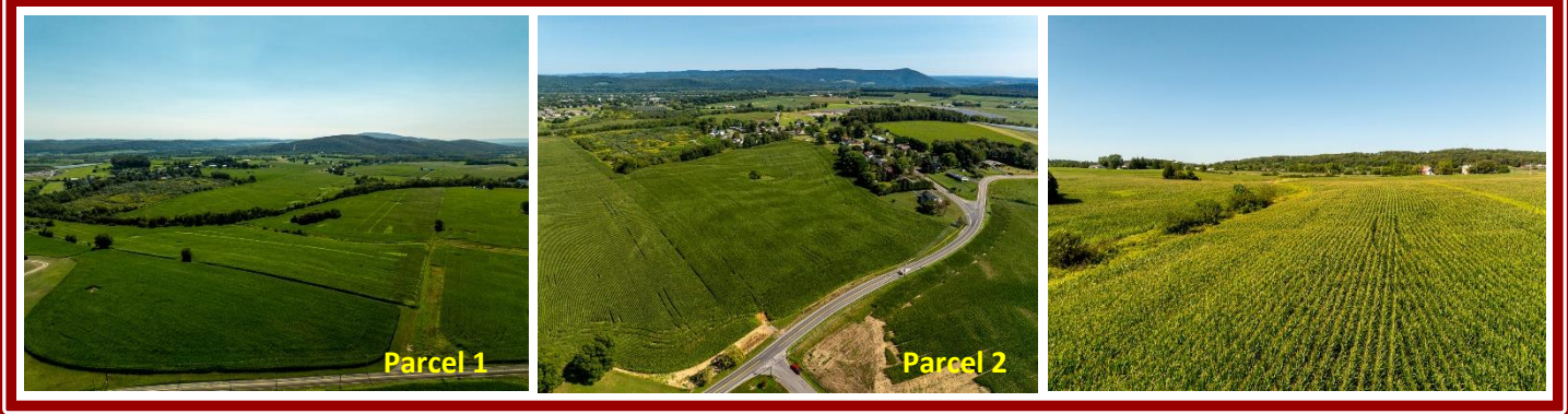
Directions: From 522 take University Ave to 98 Acres on the right. Watch for signs!

Parcel 1: Attractive & very desirable prime tillable farmland consisting of 98 +/- acres with high producing soil. This parcel has right of way access off University Avenue. Adjacent to Parcel 2. Located just outside of Selinsgrove & close to Rt 522. Has access to public sewer.